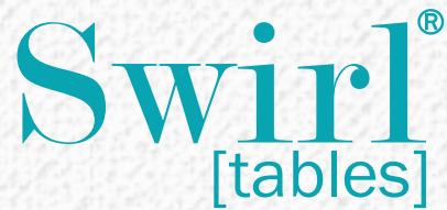
Table Care Guide

Instructions to store and maintain linenless tables