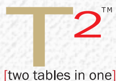
Table Care Guide

Instructions to store and maintain linenless tables