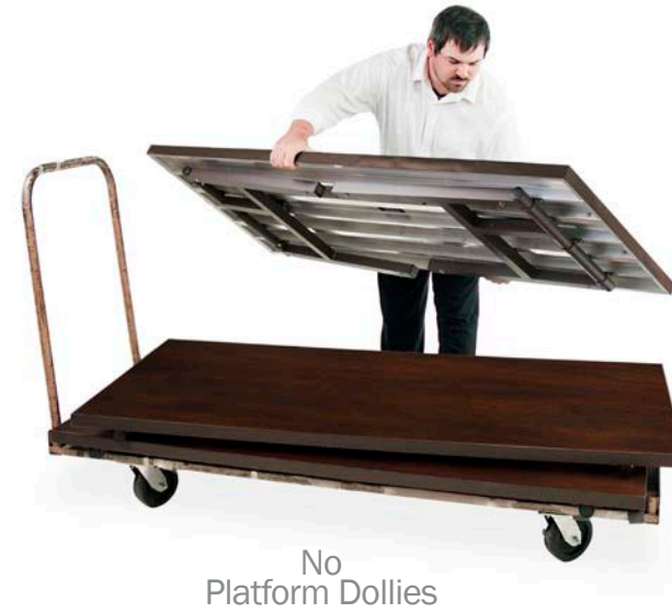
No Platform Dollies

Use improper equipment. Usó incorrecto equipo.